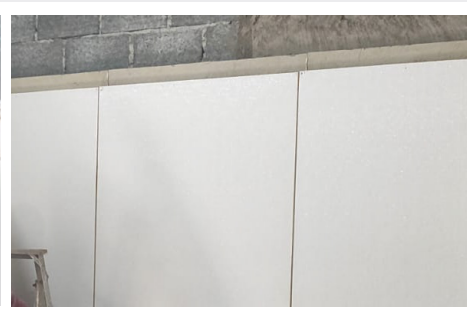
Glasbord® with Surfaseal® Sandwich Panels (Hygispan®)